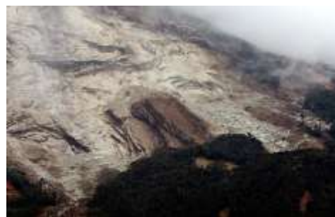
Figure 1. Occurrence of rockslide following the 6.0 moment scale earthquake in Sabah, Malaysia resulted in 18 killed

On 5 th June 2015, an earthquake with a moment scale of 6.0 struck the north-western part of Malaysia, Sabah resulting in eighteen casualties (Fig. 1). The incident has created an alarming signal to the local engineers and authorities to put greater attentions to the dynamic stability of buildings. In addition, in conjunction with the government's initiative to develop modern and sustainable transport system, there are increasing numbers of high-speed railway lines being proposed in Malaysia. The vibration / dynamic cyclic loading induced by the high-speed railway may weaken the stiffness and strength of soil and results in excessive deformation in soil, and the supporting structures. These circumstances have resulted in increasing attentions putting on the studies of soil dynamic behaviours in Malaysia.