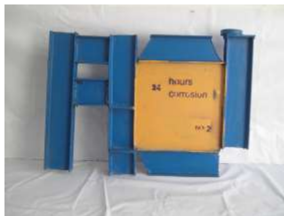
Figure 1. A typical specimen of single SPSW.

Panel members must easily to be exposure to the steam and saltwater and the experimental test must be accomplished in a closed place, the pH level of the solution and temperature of closed place must be set up according to the standard specified test methods. Experimental test carry out and the loss of weight is measured.